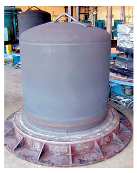
Fig. 2: RA353 Chromalloy - NV after 2 years

RA333<sup>®</sup>, 2.4608, resists both oxidation and carburization. 1200°C may be con-