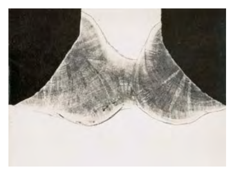
Fig. 6a: This fully welded joint can resist both thermal and mechanical fatigue

Initial Cost. Since cast parts avoid all the forging, rolling, cutting and welding of a fabrication, the price per pound of fixture may be lower.