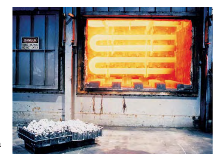
Fig. 1: Radiant U-tubes mounted horizontally in a heat treat furnace