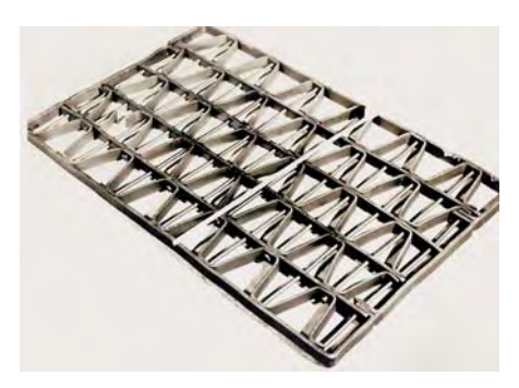
Fig. 5: Serpentine tray of 6 and 9.5 mm RA 330

Allowable stresses are often based on ASME design allowable. Much thermal processing equipment uses for design stress either one half of the 10,000 hour rupture strength, or one half of the stress to cause a minimum creep rate of 1% in 10,000 hours. Above about 540°C, creep or rupture is the basis for setting